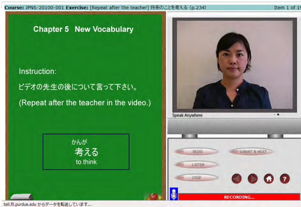
Figure 1. Practice screen

“Redo” once clicked.) When the video finishes playing, audio recording starts automatically. The students are to click “Stop” when finished. The “Listen” button allows them to listen to their recording. Finally, the “Submit & Next” button saves the recording on the server and proceeds to the next vocabulary item. Because the students had used Speak Everywhere for routine oral practice not connected to the present study, they were familiar with the operation of the program.